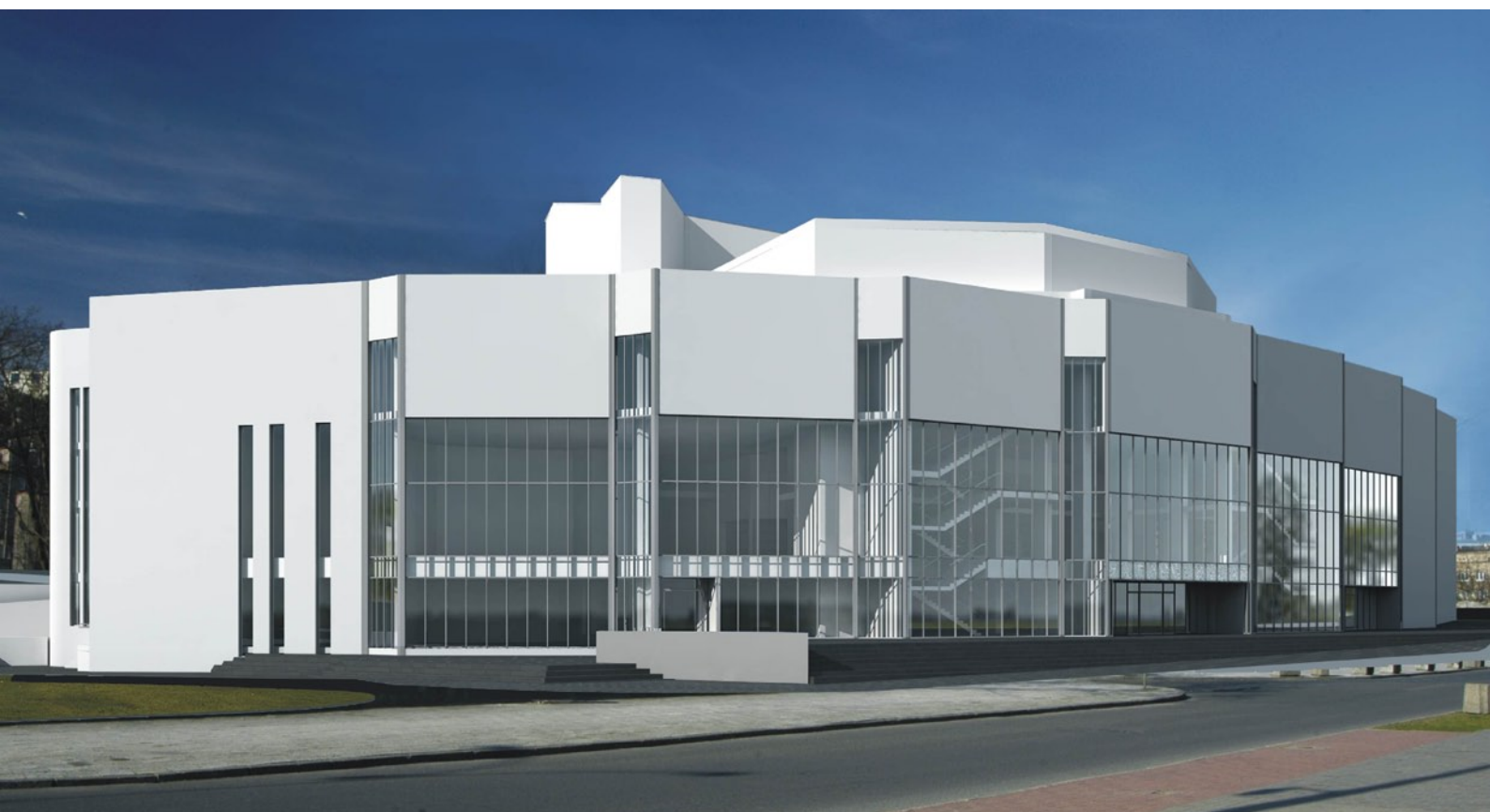
Visualisation of Music Theatre

A bunch of twigs and flowers was placed on the top of the roof of the Musical Theatre in Gdynia to denote the end of extension works. The topping-out ceremony took place on April 16, 2013. Theatre-goers will be able to see the effects of the works on September 6. As an opening performance, they will see a musical based on the novel "The Peasants" by Władysław Reymont, directed by Wojciech Koscielniak .