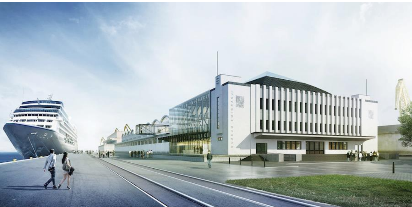
Visualisation of Museum of Emigration

The investor is Gdynia Municipality. The total cost of the Museum of Emigration project amounts to PLN 49.3 million, including the co-financing from the EU initiative JESSICA.