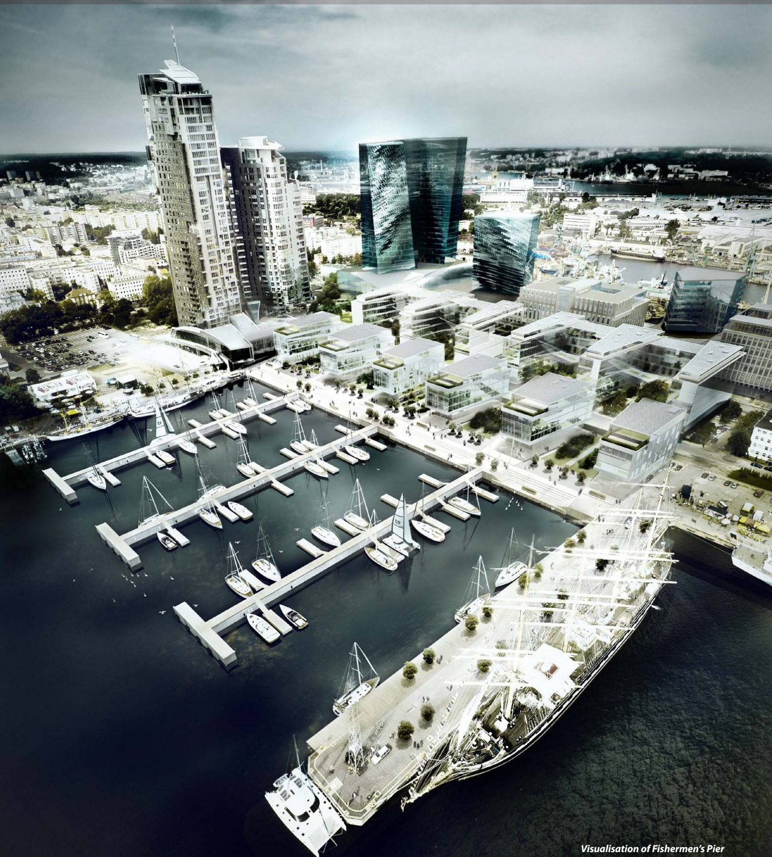
Visualisation of Fishermen's Pier

Another step to the construction of a new Gdynia centre on the Fishermen's Pier: a letter of intent has been signed by Gdynia Municipal Authorities and PHN Group (a real estate company).