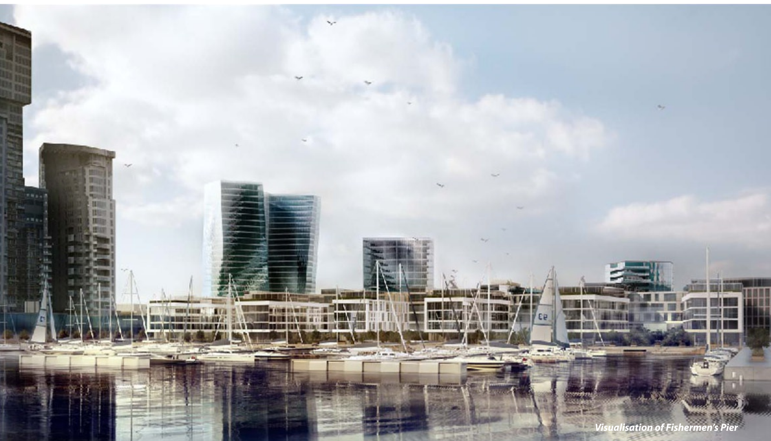
Visualisation of Fishermen's Pier

The coming years are going to face huge changes in the area of the Fishermen's Pier . A new centre will be built where Dalmor company, with its fleet fishing in seas all over the world, used to have its offices. The centre will contain restaurants and cafés, hotels, service facilities, offices, residential buildings, and attractive public spaces, including wide seafronts, marinas and a future Museum of Sailing . This is one of the most attractive investment areas, as it is situated in the heart of the city, with its three sides surrounded by the sea.